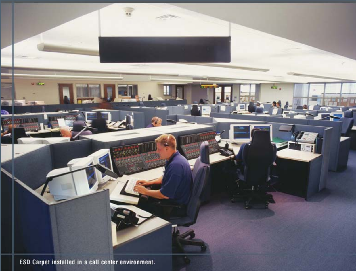
ESD Carpet installed in a call center environment.